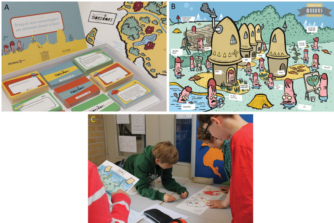
Fig. 2. The classroom game Expedition Mundus. A. The game consists of sources, such as the map in the background, question cards and answer cards. To answer the questions pupils must research the available information and often combine sources to infer the answers. B. Ground view on Mundus, one of the sources, showing different species, aspects of culture and hints of the climate. C. Children play Mundus in class, studying and combining information from sources to find answers to research questions.

questions also require information from answer cards of simpler questions to be resolved. An example of a more complicated question is, 'There are spiceherb seeds in the soil of the hills on Mundus. What region of Mundus do these seeds mainly come from?' To resolve this, first a map is needed that shows the location of the hills and the distribution of plant species on the planet, including the possible sources of the seeds. It turns out that the spiceherb species does not grow in the hills but does occur northeast and northwest of the region. In order to resolve which single area is the source, pupils need to combine a Mundian biology book showing that the spiceherb produces its seeds in the season called 'klang raf raf', and a chart of measured wind speeds and directions for a few years, showing that high wind speeds from the northwest frequently occur in the right season. Occasionally pupils just gambled and pick one of the two possible directions from the first-mentioned source. However, when the initial answer was wrong and they investigated further, the question was answered correctly by the pupils, showing that they can do complicated logic of inference and combination of sources.