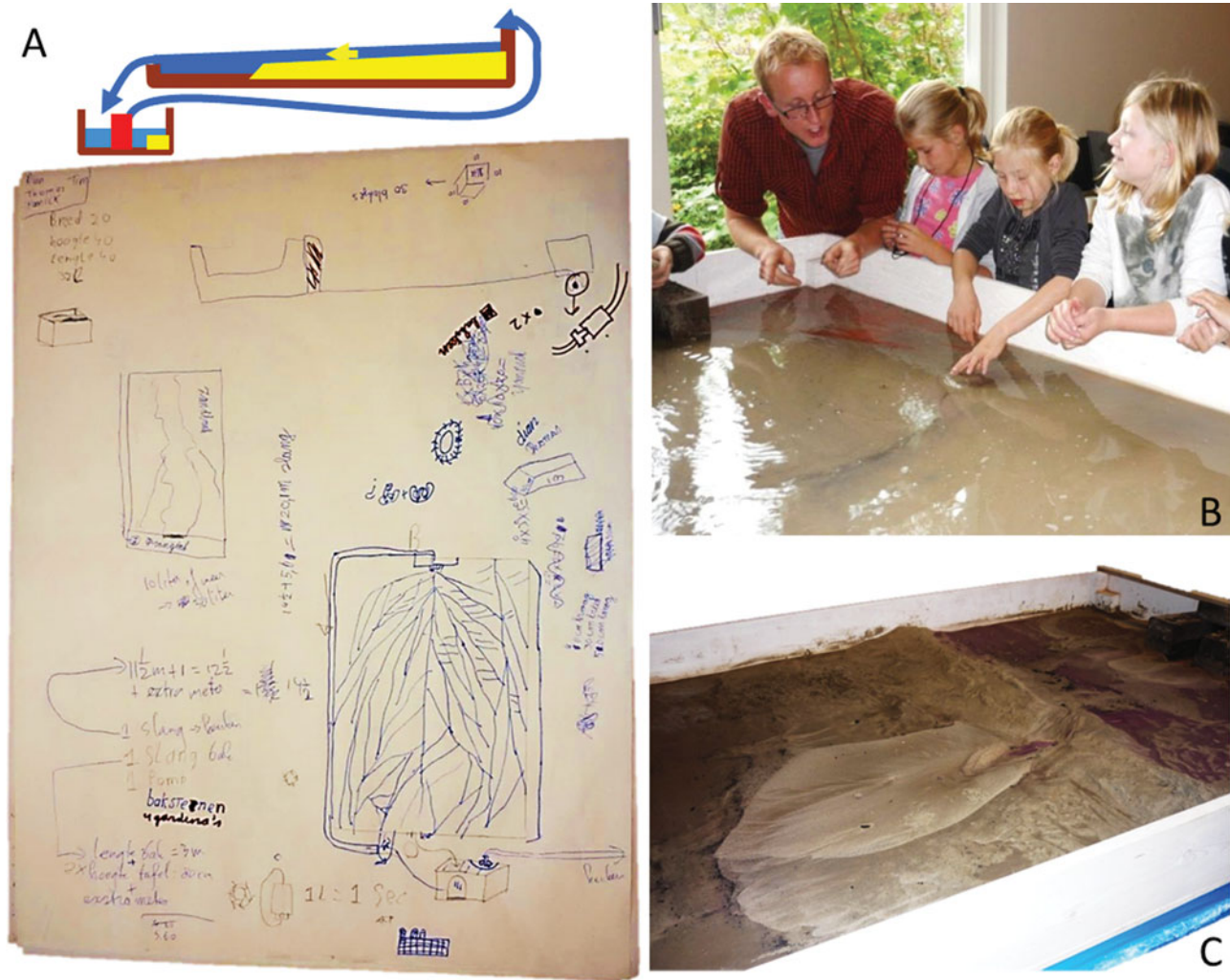
Fig. 3. A set-up of sandbox experiments in Primary School De Klokbeker, Ermelo. A. Example of the design of the sandbox and the hydrological cycle simulated with the pump by pupils. B. Delta experiment, showing explanation by a scientist and impatience to manipulate the experiment in a pupil. C. Dike breach experiment (from right to left), showing a scour hole and splay that pupils compared to real splays in Google Earth.

focused on preventing groundwater seepage and strengthening dikes by growing vegetation on them. These experiments inspired many new questions about natural fluvial landscapes, human settlement, spatial planning and dike design. Furthermore, classroom discussions put the new tacit understanding of flood protection into the rather abstract context of the last major flooding of the Netherlands in 1953, which had been taught in history class a few weeks earlier. This shows that the scientific classroom activities led to questions by pupils about related subjects in wider contexts, including contexts taught in other lessons unrelated to our activities (Bastings, 2012).